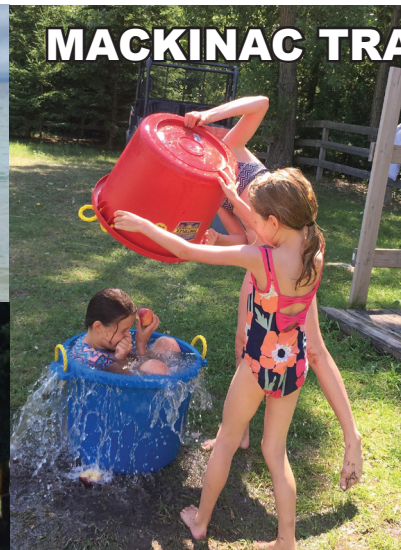
MACKINAC TRAILBLAZERS 4H