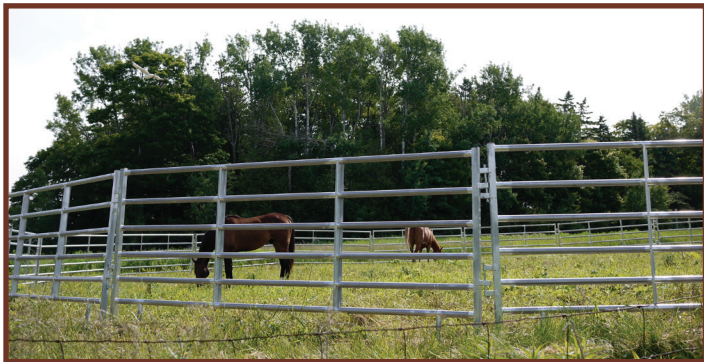
MHA horses enjoying the space of the new paddock on the site of a reused capped landfill. Support for repurposing this site came from the Mackinac State Historic Parks, Mackinac Island Community Foundation, Dept. of Public Works, and various private donations.