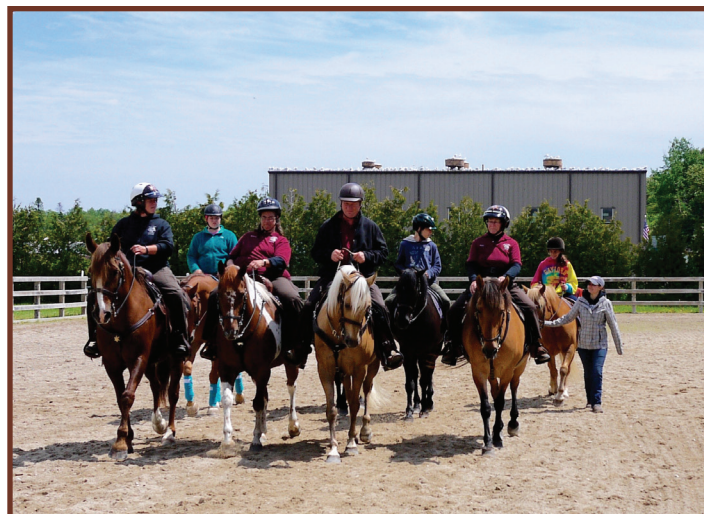
Eaton County Mounted Unit teaching a group of students drill team moves at a free clinic offered at the MCEC this summer.