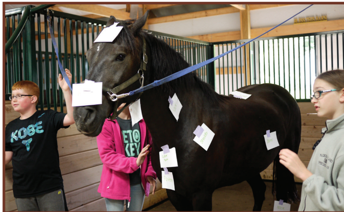
MHA horse Marco patiently awaits the judge's decision on the accuracy of his team in naming horse parts at a day camp this summer.