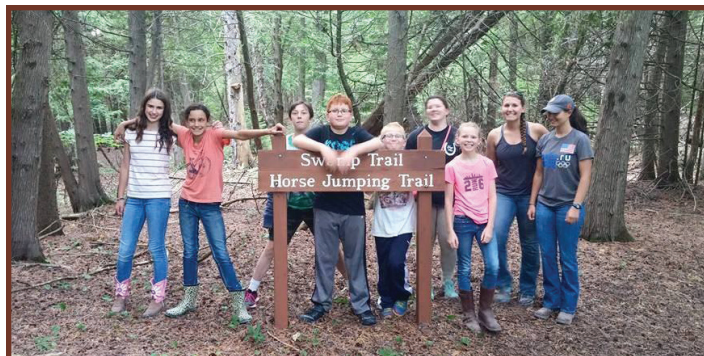
Mackinac Trailblazers 4H club take a break from their community service project cleaning up Swamp Trail. Tools to accomplish this were donated by Mackinac State Historic Parks.